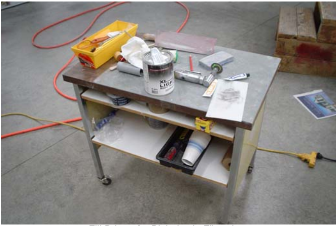
Fill Primer for Pinholes in Fiberglass