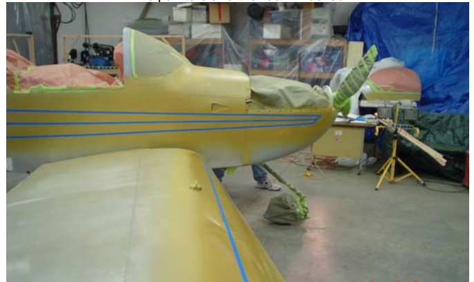
Gold stripes painted and masked