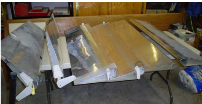
Control surfaces removed