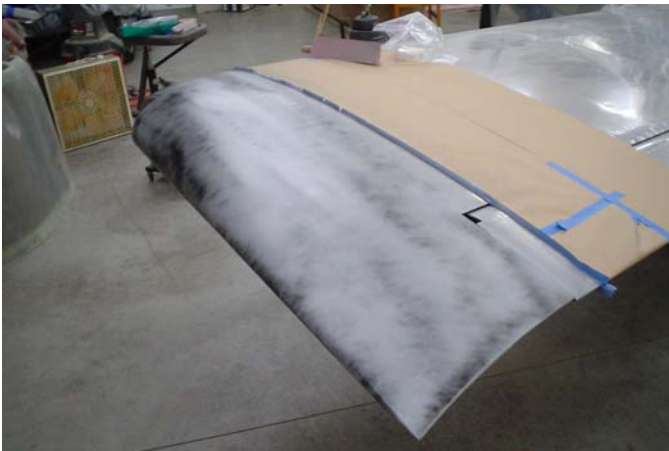
Filler primer needs to be sanded off, and redone, again and again