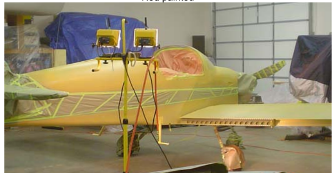
Red masked, the yellow is primer