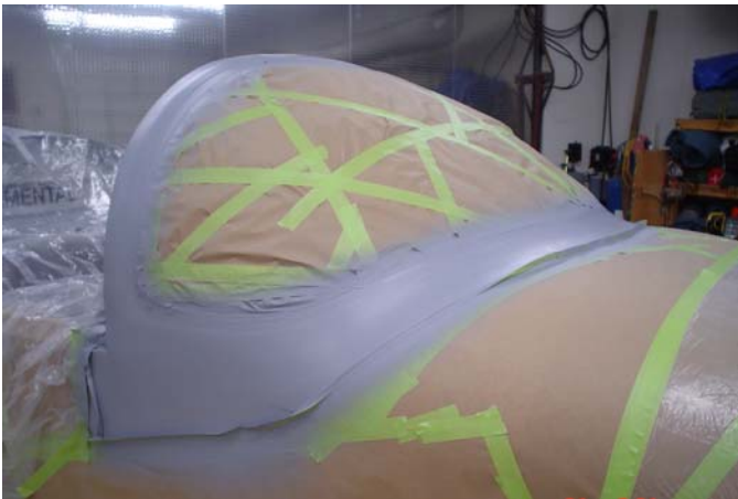
Masked windscreen, filler primer sprayed