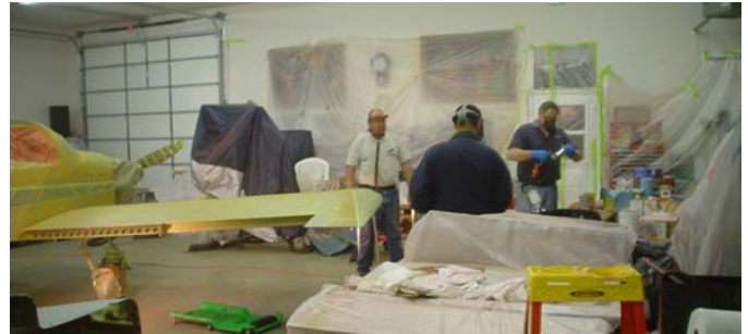
The painters and the room masked