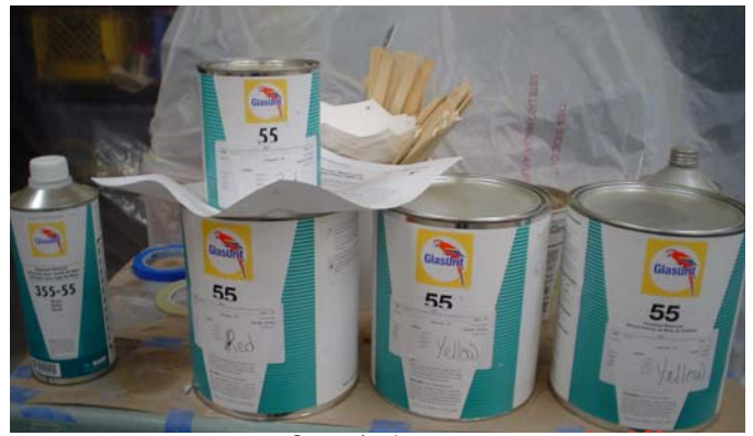
Cans of color coat