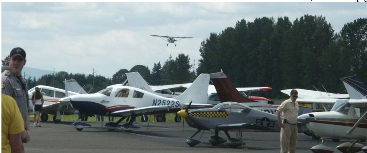
Memorial Day at Independence Airport and Chapter 292