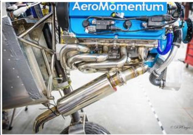
Exhaust system installed on 701.