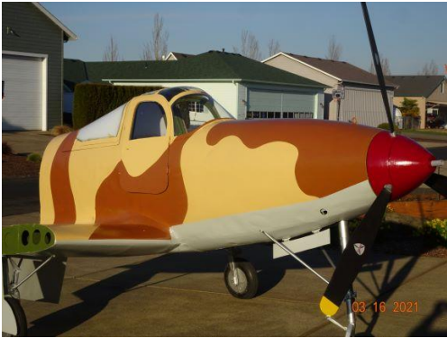
P-39 on its wheels.