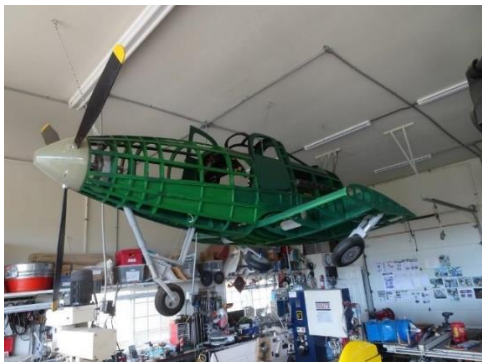
P-39 airframe with chromate primer.