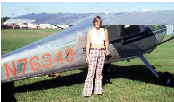
Taking another cousin for a ride in Chadron, NE during my "captivity" there.

On August 7 th I left Oshkosh and started to head home. After wandering South, I flew to Nebraska and I say got kidnaped by all my relatives there. Every day something was going on. I kept delaying my departer with my dad saying I needed to come home. There were fences to build and a yard to put in at the new home!