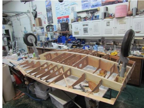
Center section assembly with PVC LG.