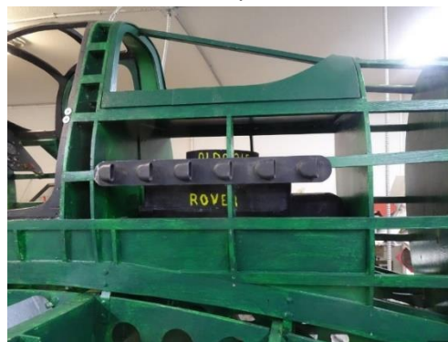
Buick/Rover aluminum V-8.