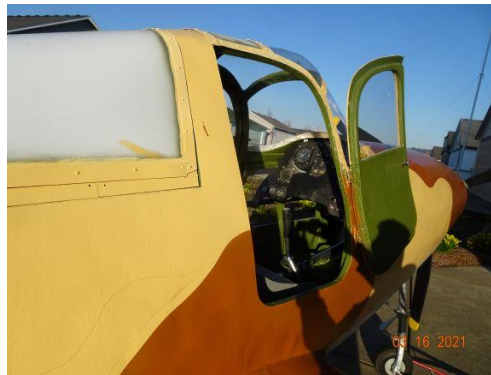
P-39 cockpit interior.